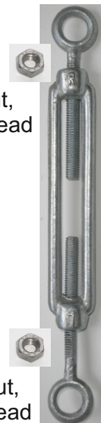
M6 nut, left thread