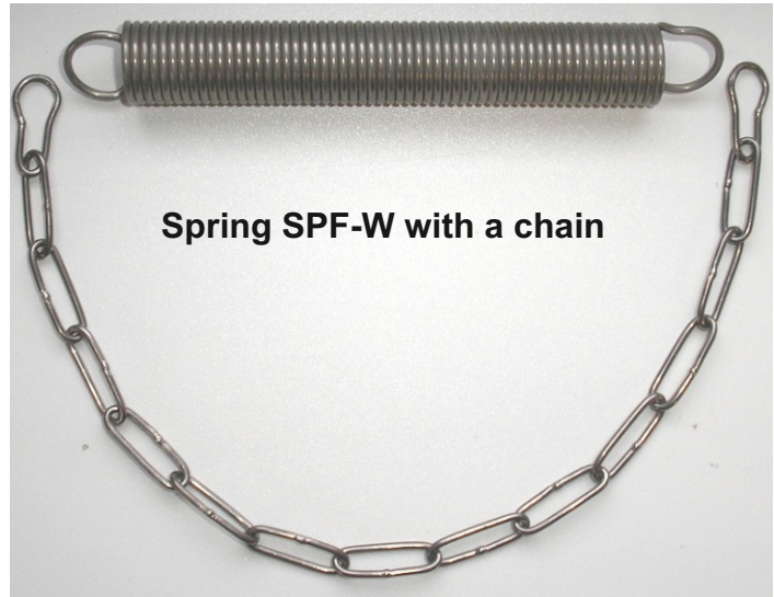
Spring SPF-W with a chain