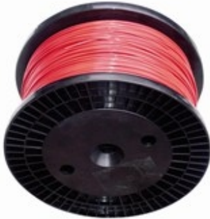
Cable RL 3

Drum with a cable RL5, the length of 500 m Drum with a cable RL3, the length of 500 m