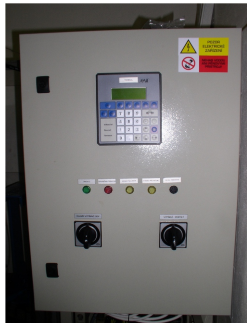
Switching cabinet of KOR-1

The catalogue has only those selected important parameters for your final decision. For project designs always ask for the user's guide for this product and any engineering consultation about possible uses.